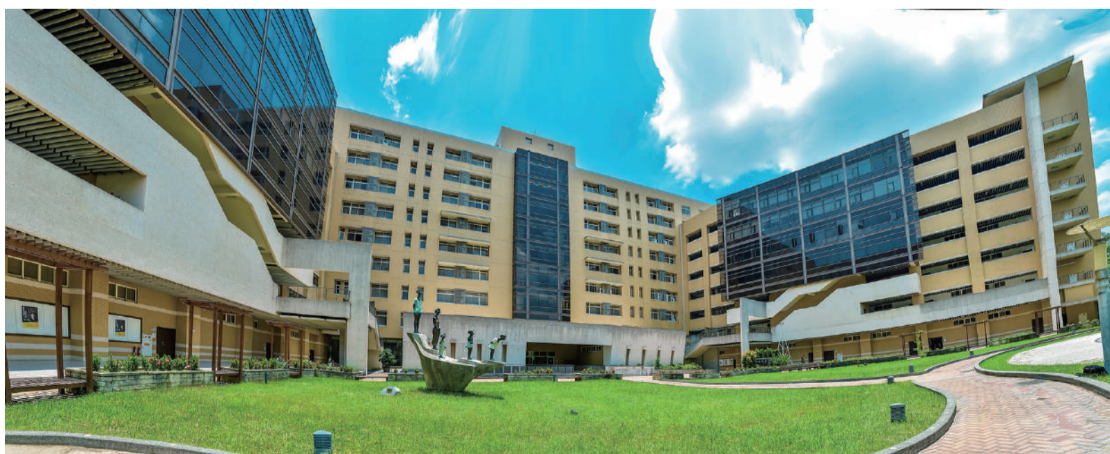
The building of College of Law and Politics in NCHU.

Taiwan is currently the 22nd largest economy in the world and ranks 15th in the world in GDP per capita. It is an island nation centrally located in the Asia Pacific and boasts one of the most progressive and multicultural societies in the region. Taichung has 2.8 million dwellers and is the second largest metropolis in Taiwan, behind Taipei, the capital city. As a vibrant and relaxed city, Taichung consistently ranks among the top cities for living in Taiwan.